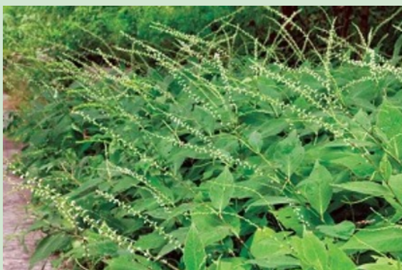
jumpseed ( Persicaria virginiana )

Despite the hot end-of-summer days we are still experiencing, our nursery operation is shifting in anticipation of the coming fall, and making preparations to get a jump on next spring's growing season.