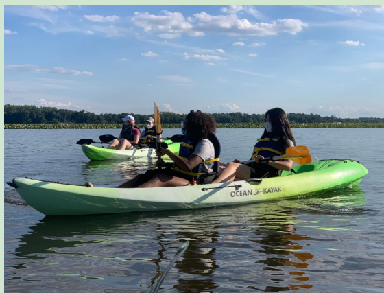
Kayaking on the Delaware