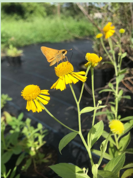
Common sneezeweed ( Helenium autumnale )