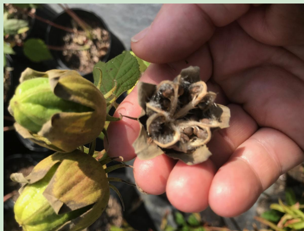
Hibiscus seeds

maintaining the health of our human partners. Although most of us feel sad to see the days getting a little shorter and the summer coming to a close, autumn life at LandHealth's nursery has plenty to look forward to!