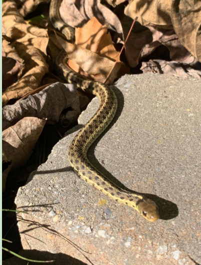
Dekay's / brown snake ( Storeria dekayi )