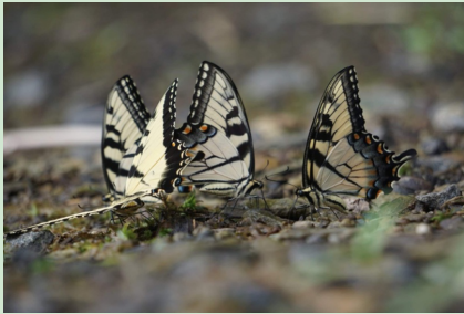
Eastern Tiger Swallowtail ( Papilio glaucus linnaeus )