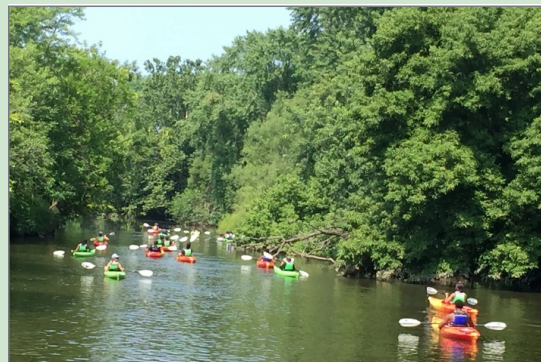
Kayaking on the Delaware River at Glen Foerd with PWS.