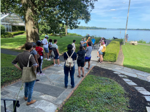
Glen Foerd Estate, House and Grounds Tour with PWS Stewards