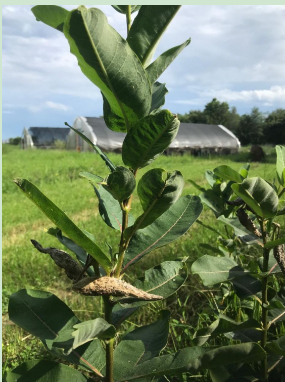
Milkweed seed pod