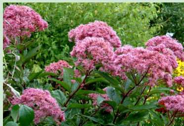
Joe Pye Weed ( Eupatorium fistulosum ) at the LandHeath Nursery