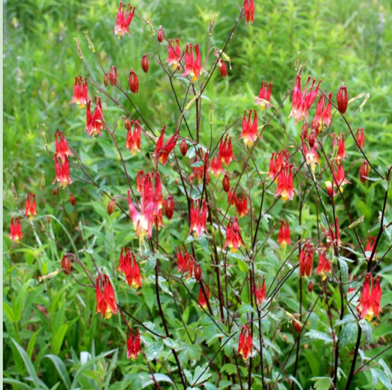
columbine ( Aquilegia canadensis )

maintaining the health of our human partners. Although most of us feel sad to see the days getting a little shorter and the summer coming to a close, autumn life at LandHealth's nursery has plenty to look forward to!